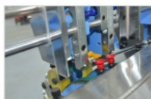
Auto Feeding 自动吸纸