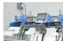
PLC Controller PLC 控制结构