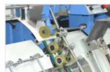
Paper Feeding down